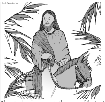
Blessed is he who comes in the name of the Lord.