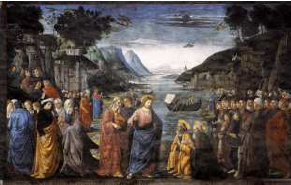
This picture - The Calling of Peter and Andrew by Domenico Ghirlandaio (1449-1494) - is a fresco on the northern wall of the Sistine Chapel.