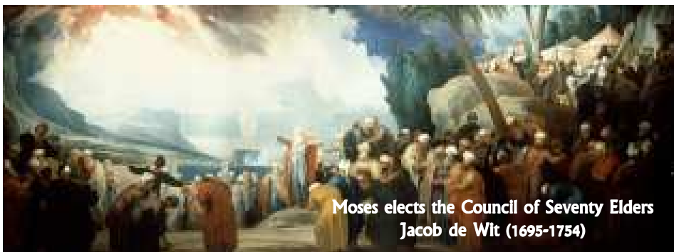
Moses elects the Council of Seventy Elders Jacob de Wit (1695-1754)