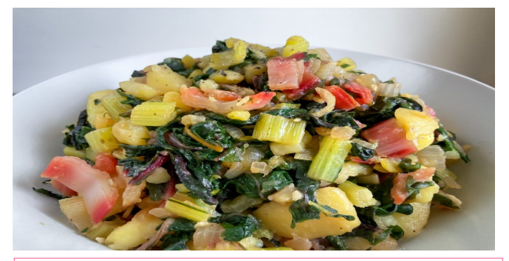
YIELD: 2-3 MAINS (OR 4-5 SIDES) Blitva - Croatian Swiss Chard with Potatoes

Blitva is an incredibly easy, quick-to-prepare, healthy and so delicious vegan recipe from Croatia, made out of Swiss chard and sautéed potatoes.