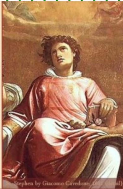
St. Stephen by Giacomo Cavedone, 1691 (detail)

The Guild of St. Stephen traditionally award their crosses, medals and awards to altar servers on this day.