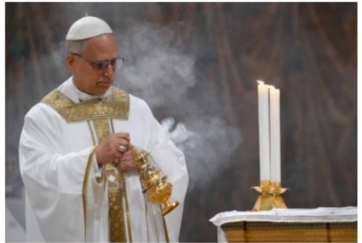
Pope Leo XIV first Mass as holy pontiff, May 9, 2025

CYO Fall Registrations are now open for the sports below! Boy's Flag Football (2nd-5th grade) – Cross Country (3rd-8th grade) - Girl's Volleyball (3rd-8th grade) - Tackle Football (5th-8th grade) You can register at https://cyojwa.org/current-programs Visit our Home Page for additional information at https://cyojwa.org/home