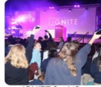
IGNITE for Life 9:00am

Come Holy Spirit, enflame our hearts to protect the lives of unborn children and expectant women!