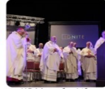
KS Mass for Life 10:30am