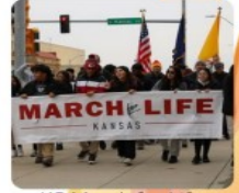
KS March for Life 12:00pm